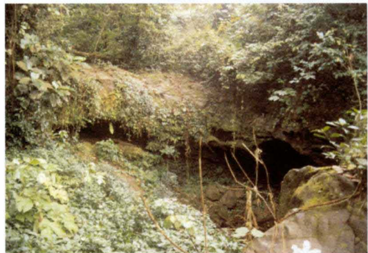
Figure 2. Environs of the nest of Grey-necked Picathartes Picathartes oreas , Mt Cameroon, 12 December 2005 (David Hořák)

Nid du Picatharte du Cameroun Picathartes oreas dans un cours d'eau asséché au pied du Mont Cameroun, 12 décembre 2005 (David Hořák)